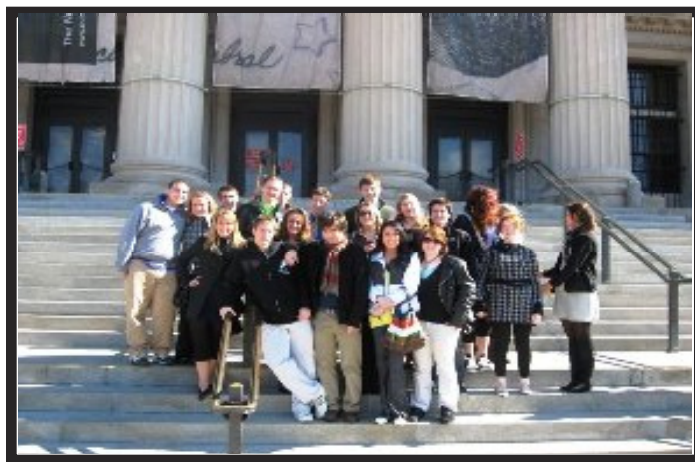
Twenty-three STVM students attended the JSA Winter Congress in Washington, D.C. in February.