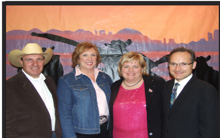
2009 SHOWCASE CHAIR COUPLES

On "Fat Tuesday," February 24, Showcase will be selling donuts all day in honor of our New Orleans theme!