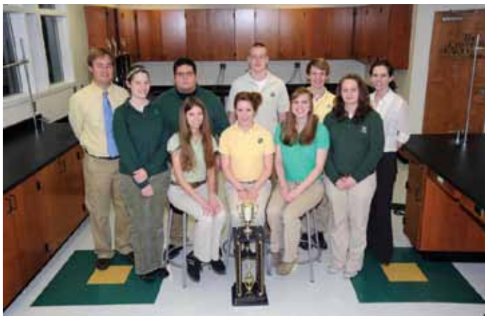
St. Vincent-St. Mary High School Science Students participated in 62nd Annual State Science Day