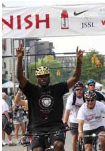
LeBron James VM03 rides in the 2009 Bikeathon

LeBron James VM03 and the LeBron James Family Foundation hosted the 2010 State Farm “King for Kids Bikeathon” on Saturday, August 7, 2010.