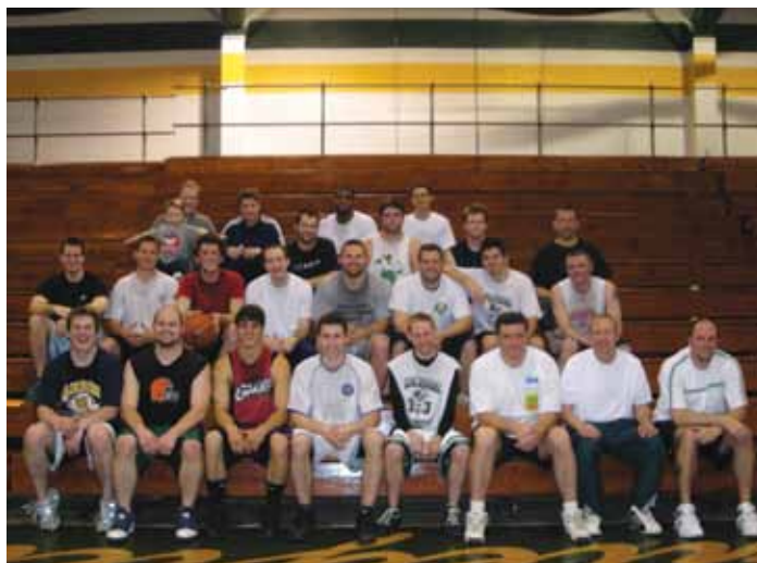
3 on 3 participants