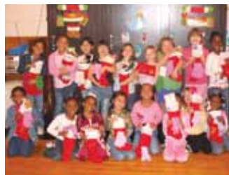
McBright Elementary Students