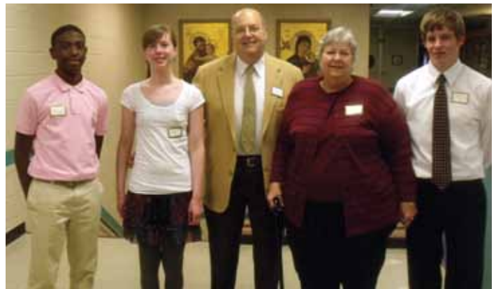
Nick and Eileen Antonino Family Scholarship