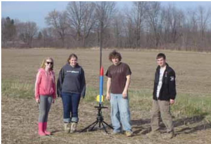
Members of the STVM Rocket Team, sponsored by National Machine, prepare to blast off