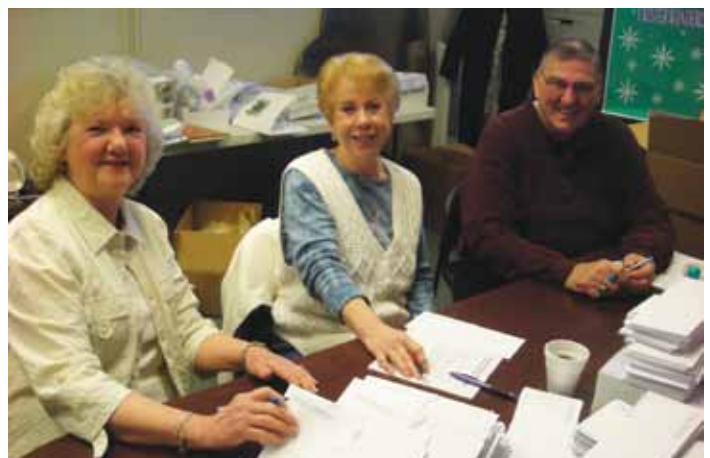
Classmates from M56 gathered to encourage their fellow alumni to continue the tradition of excellence