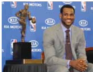
LeBron James VM03

For more information or to volunteer, please visit the website: www.catholicworkerakron.com .