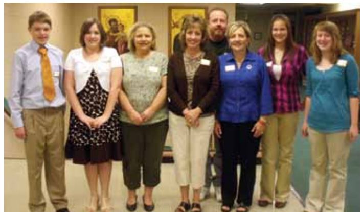
Christine Clark Memorial Scholarship

COME HOME FOR HOMECOMING ALUMNI REUNION NIGHT OCTOBER 1, 2010