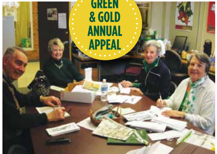
Classmates from V50 gathered to encourage their fellow alumni to continue the tradition of excellence