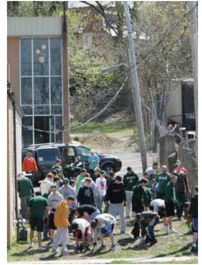
Members of the Fighting Irish Baseball Team pitch in to help the Victim Assistance Program this past spring