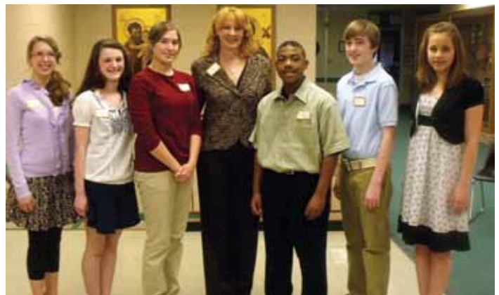
Dr. Frank Mellion Memorial Scholarship