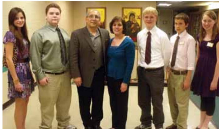
Ray Tricomi Memorial Scholarship